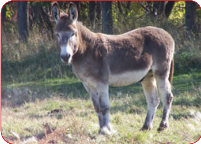
Ace sells with the harness.