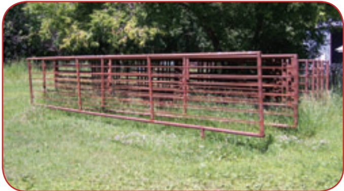
24' panels - approx 100 panels