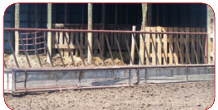
24' bunk feeder