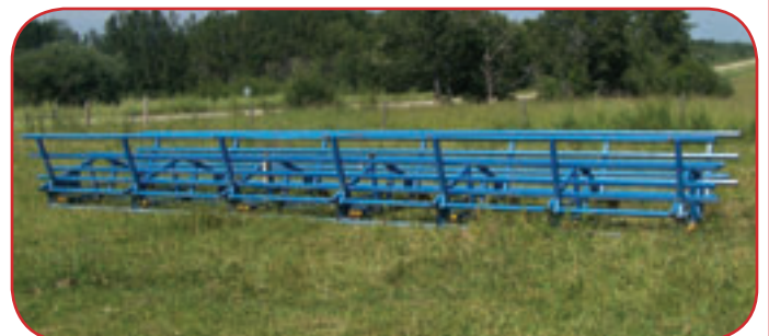
30' bale hauler/unloader