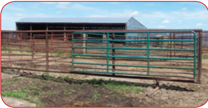
7X24' panels with gates