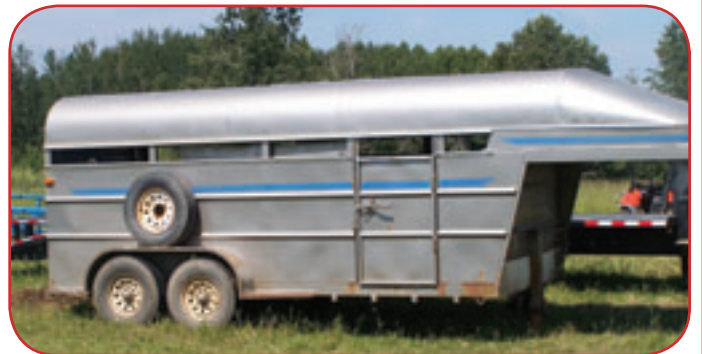
16' Real Stock Trailer