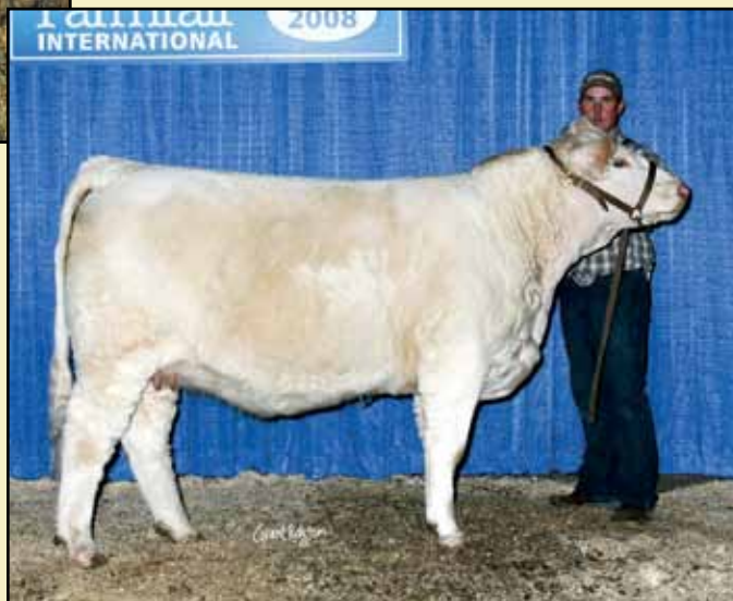
PROK 31T - maternal sister