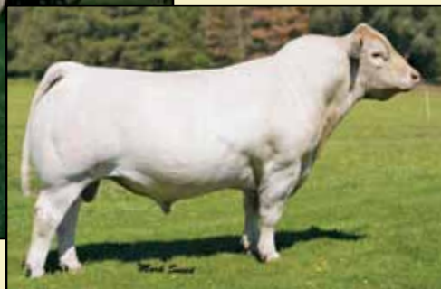
TR Mr Fire Water 5792 RET