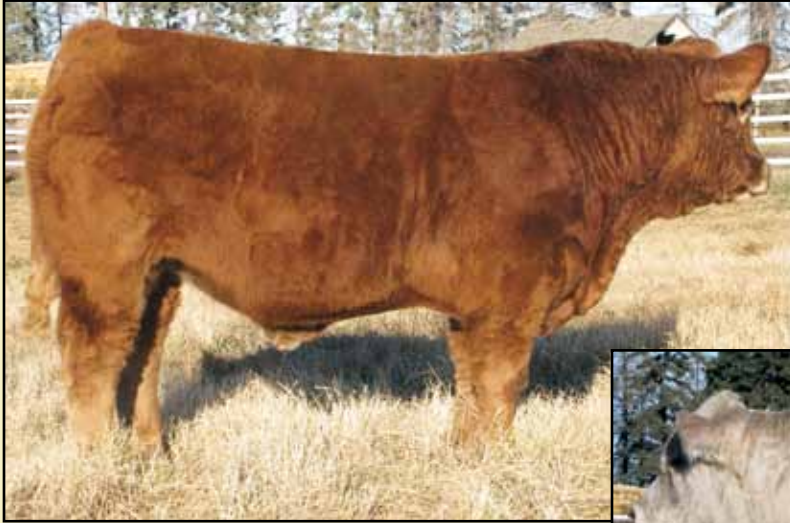
CIRCLE CEE FIRED UP 104Y QPMC339569

Circle Cee Charolais Farms is offering you the pick of all 4 bull calves that we will be showcasing at the Alberta Select Show and Sale. 2011 marks the 40th anniversary of Circle Cee Charolais Farms in the Charolais breed – and this exciting lot is in celebration of this achievement.