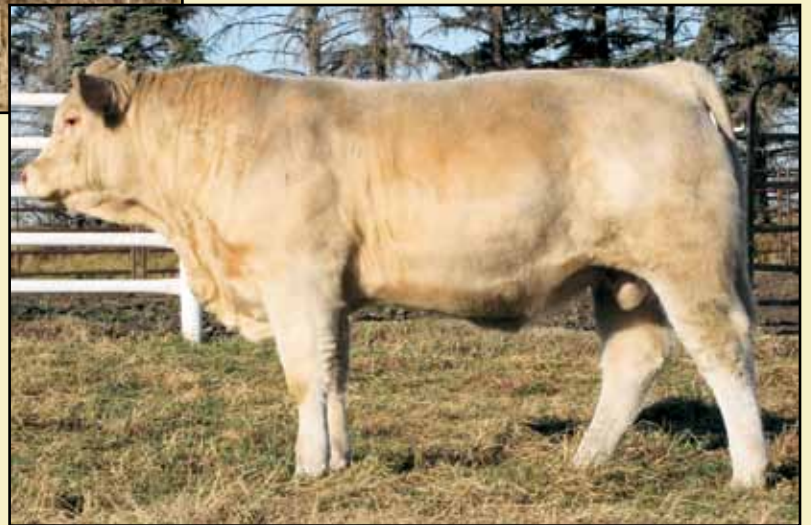
DJ LIBERTY 1Y

Sire: D R Revelation 467 Dam: Circle Cee Ikaria 724T.