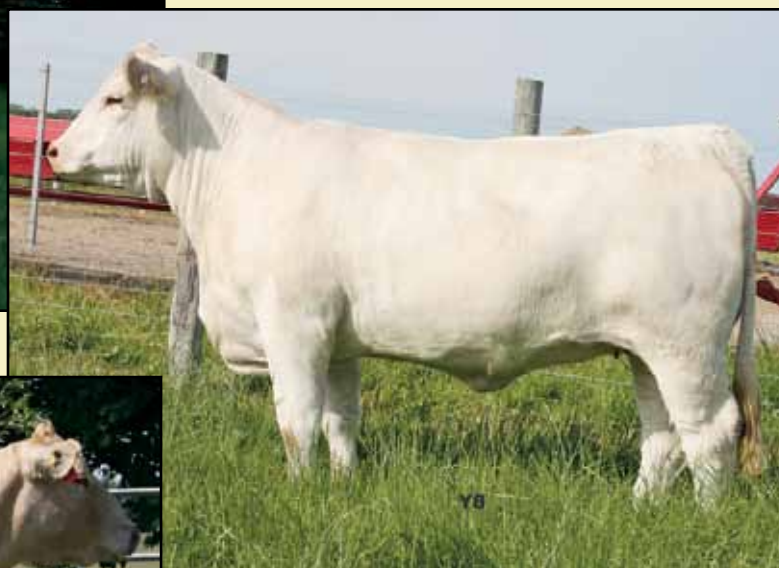
SVY HVA Flirtin 805U