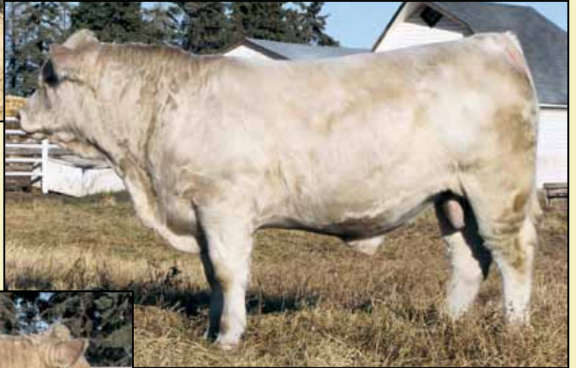
CIRCLE CEE BLUESKY 101Y PMC338715

Sire: MXS Irish Cream 973X Dam: JWX Sweet Thing 406T.