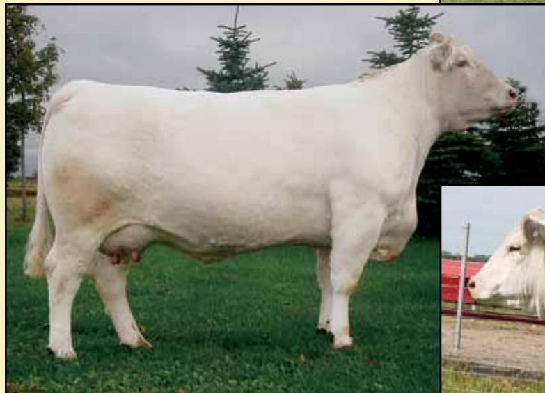
Rollin Acres Lizzie 7S