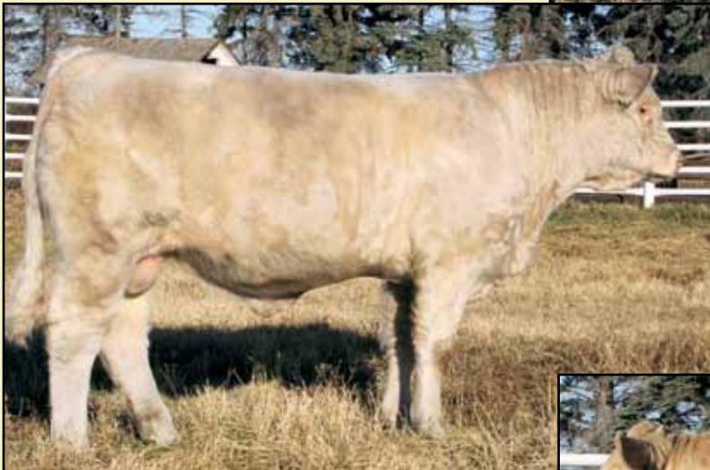
CIRCLE CEE REVVED UP 109Y SMC338716

Sire: LT Bluegrass 4017P Dam: CEE'S Lady in Red 906W.