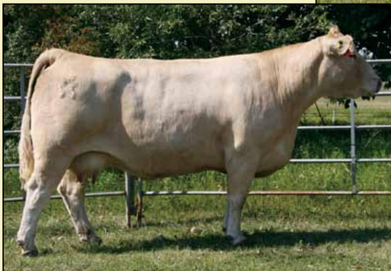
POG Red Lass 75L

We have been averaging over 20 embryos per flush lately. To add to the excitement we will offer semen from any of our herd sires; 2008 National Champion Hercules, 2010 National Champion and Farmfair Supreme Champion Sudden Impact, and the hottest bull in Canada TR Firewater. Do not miss this unbelievable opportunity to move your program to the next level.