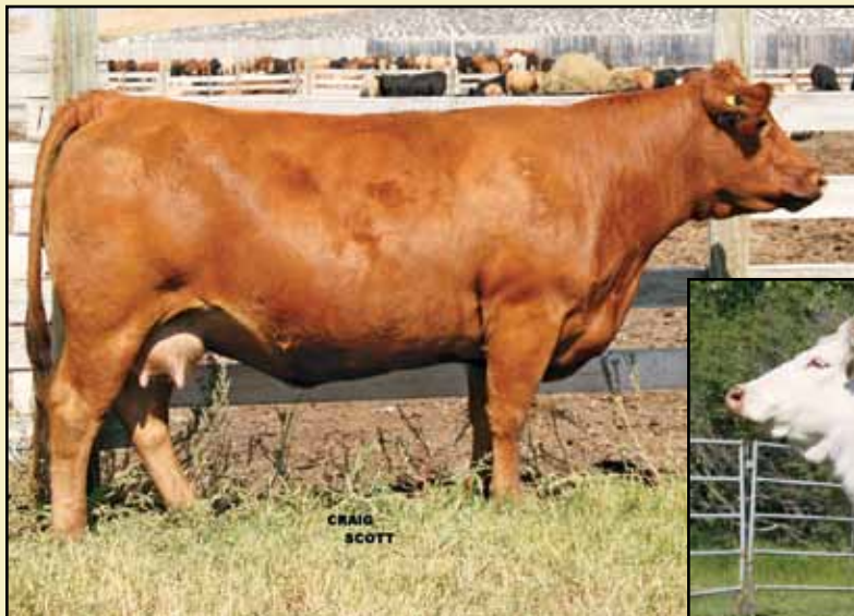
SDC Victoria 51R

At no other sale than the ACA Select Show & Sale will you get an extraordinary opportunity to flush any cow that Clear Lake Charolais owns. Our cowherd has been carefully selected with some of the most prolific females in the breed.