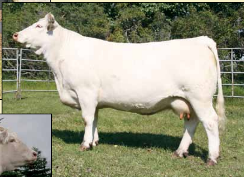
Sparrows Krystal 116R