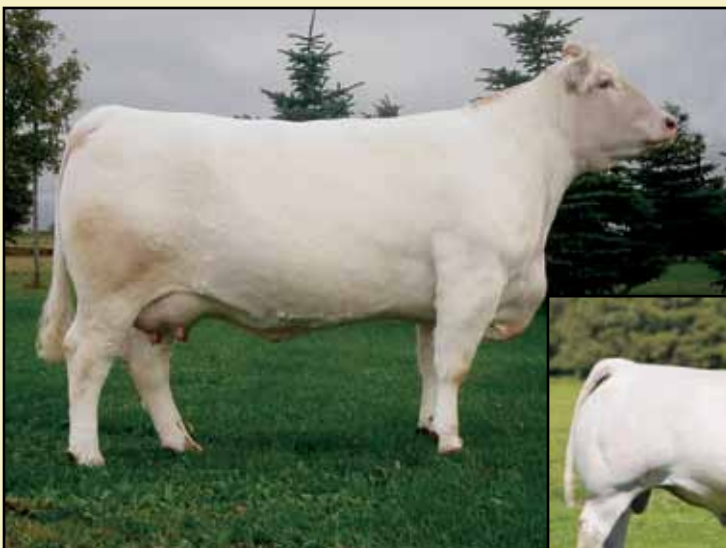
Rollin Acres Lizzie 7S