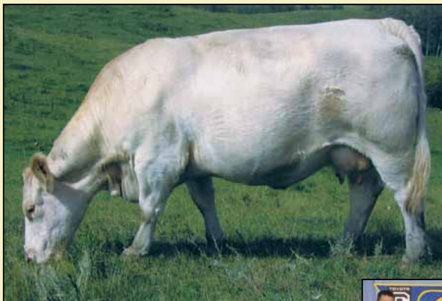
DBAR Miss Priss 9K

DBAR Miss Priss 9K X Gerrard Montezuma 6T