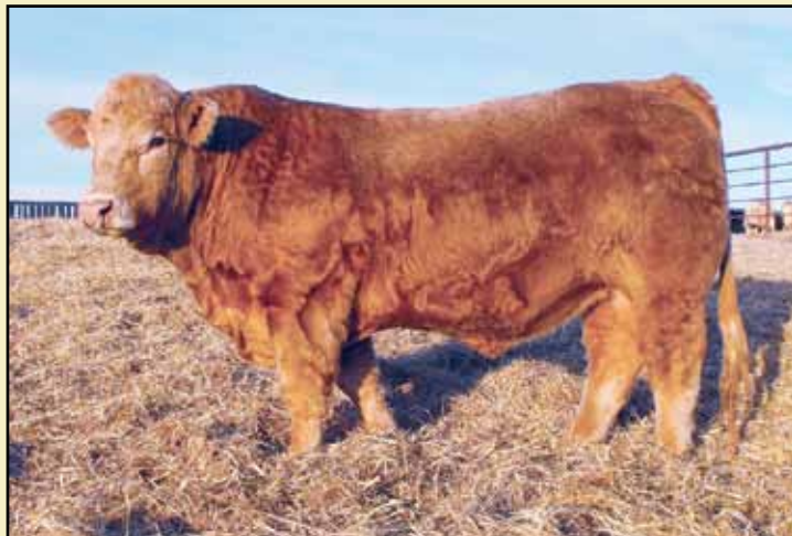
JWX Triple Play 34T