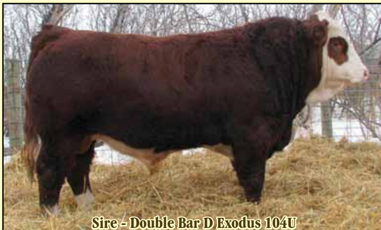
Sire - Double Bar D Exodus 104U