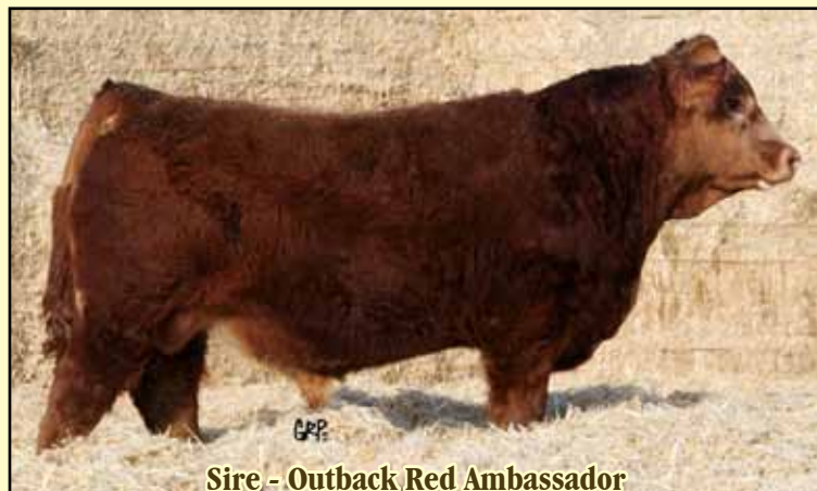
Sire - Outback Red Ambassador