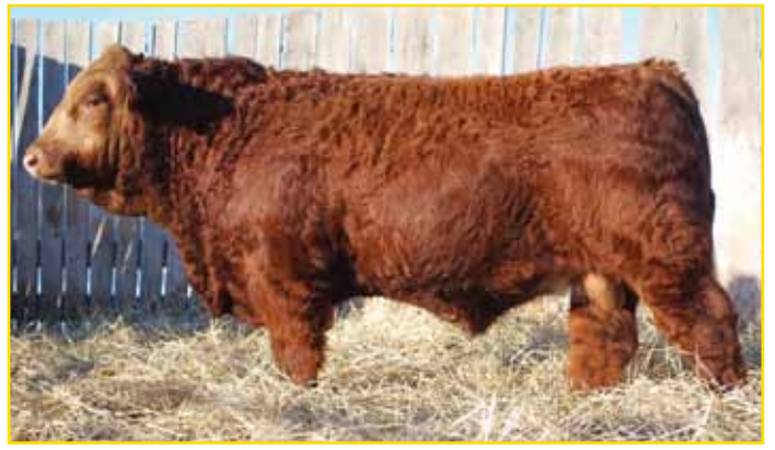
Beech Bros Utilizer 414U