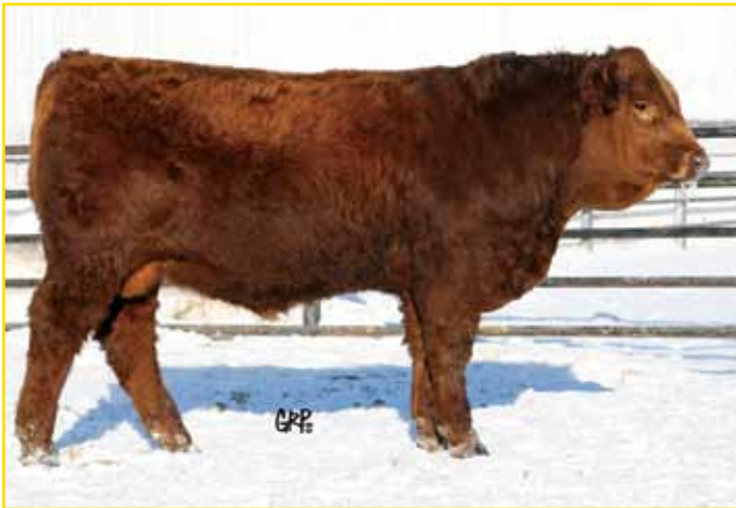
Remington Specialist 32W