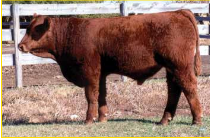
X-T Tabasco 20T