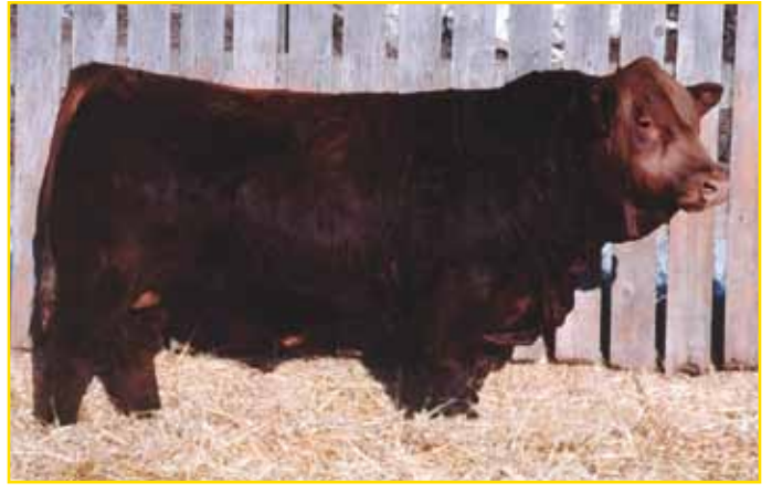
IPU Red Bodybuilder 62S