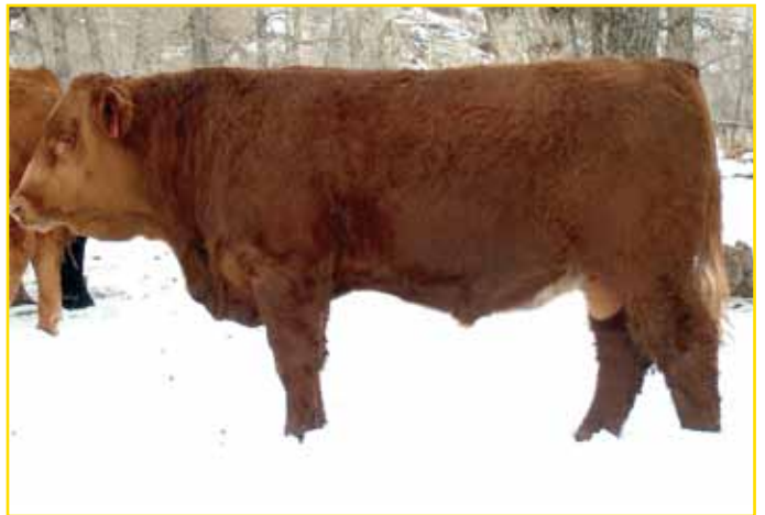
TBSF Washington 67W