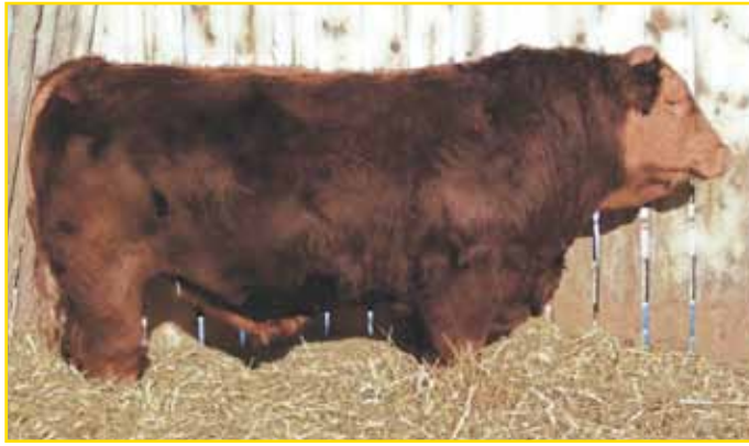
Beech Bros Shenanigan HHS