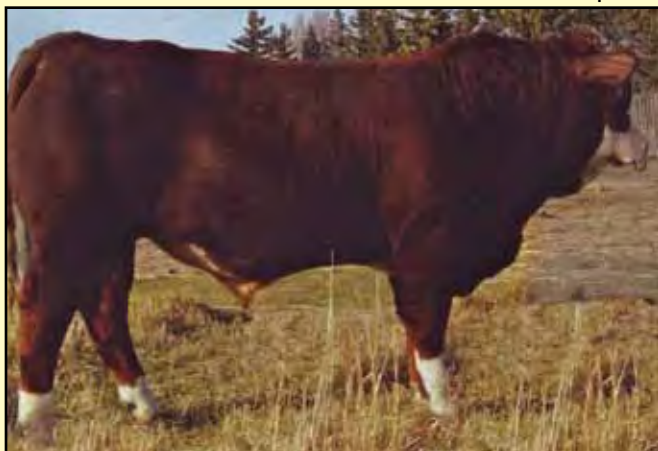
Silver Lake Legacy Marc 3Y - service sire