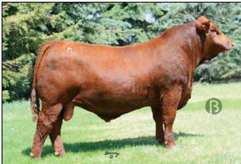
TNT Bootlegger Z268