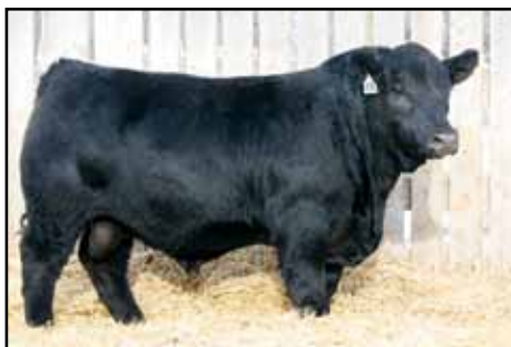
Lot 2 - IPU El Tigre 28B