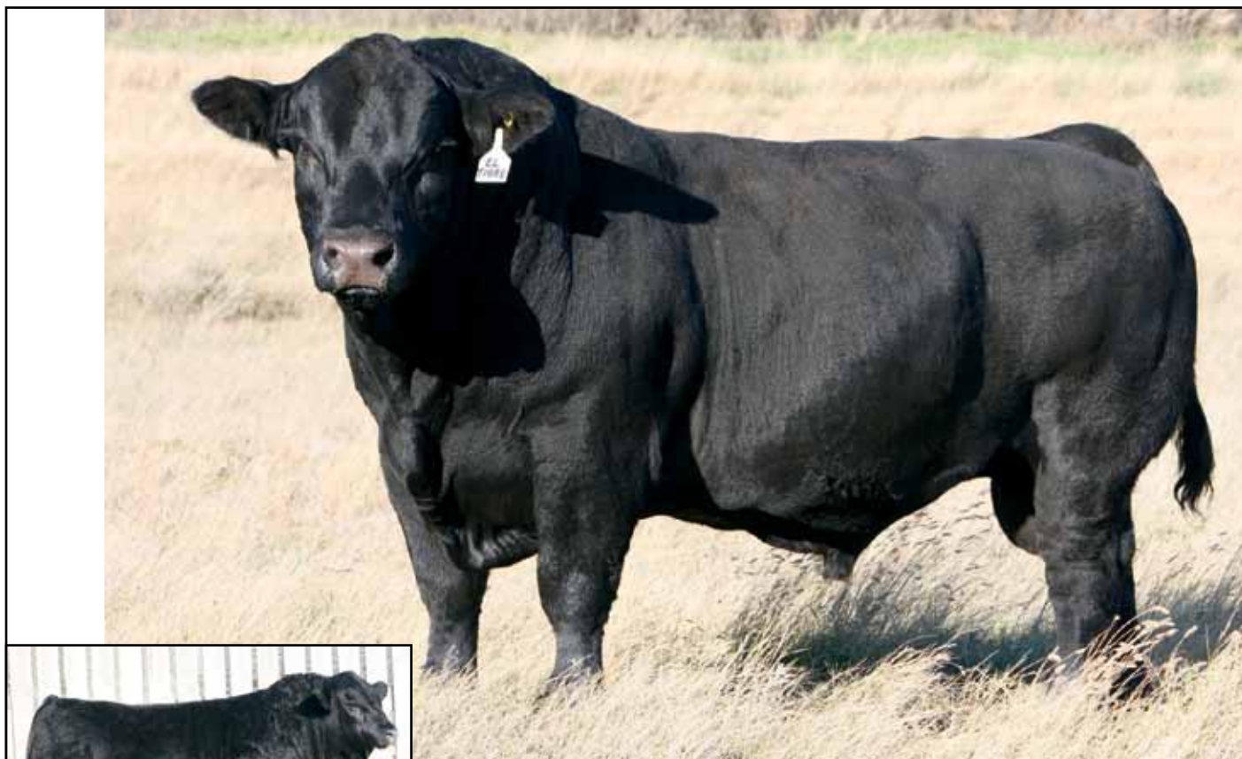
El Tigre in October 2014

A $61,000 Investment that's really working!!!