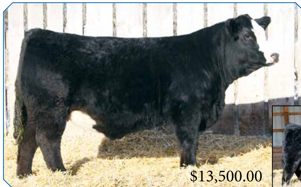
Sire - Drake Poker Face 2X