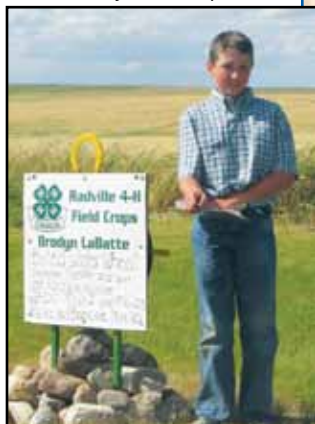
Brodyn 4-H Crops