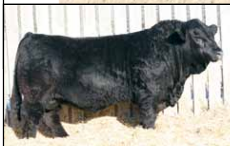
Lot 1 - IPU One in a Million 71B CSA #10000000

The next opportunity to invest in El Tigre daughters will be March 6th.