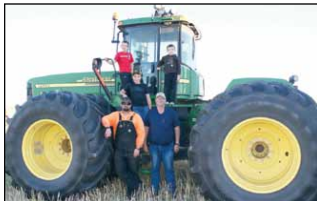
3 generations of LaBette men

Every year we like to put a few calving ease type bulls in our sale and we think Red Mountain 5B will definitely fit the bill. He has an 82 lb birth weight, was born unassisted and has a short 282 day gestation. He is mothered by a beautiful first calf Specialist daughter that herself had an 80 lb birth weight. She is a moderate, excellent uddered young female we really like. This smooth made Red Mountain son is in the top 1% for calving ease EPD and top 20% for birth weight.