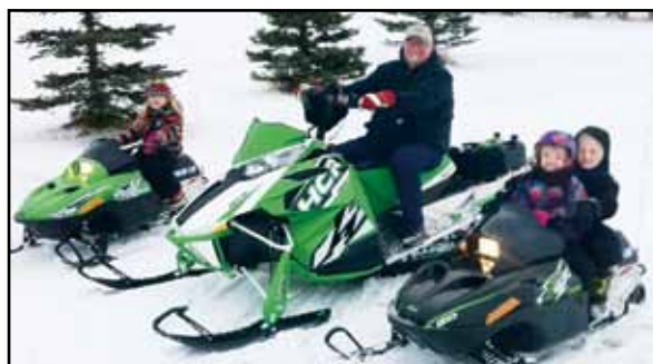
Grandpa and the girls on Christmas Day