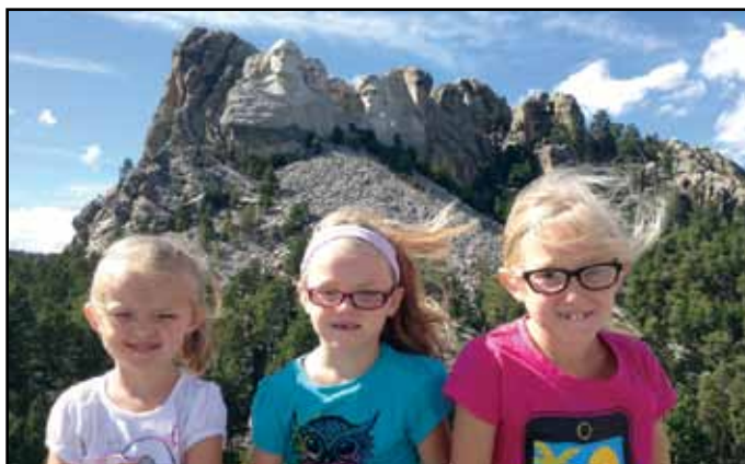
The girls on a summer holiday at Mt. Rushmore

A solid black Poker Face out of a first calving Stubby daughter going back to the Eldandi cow family. This heifer would have a little touch of Fleckvieh in her as her grandmother was a black baldy, half Fleck cow. 43B is moderate and will make a real easy doing cow.