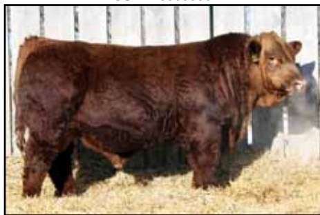
Lot 7 - IPU El Tigre 92B