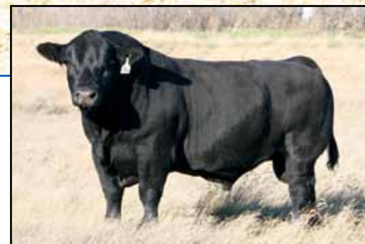
MRL El Tigre 52Z