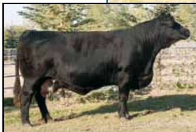
Ultra Temptress Clair 12R

A Liner 56U son that's a maternal brother to our One In A Million 71B bull. We flushed Clair 12R in the spring of 2013 resulting in full brothers 71B and 83B and then she bred back to Springcreek Liner 56U for this her natural calf born in 2014. 129B has two full sisters working at Meadow-Acres Farms that were in the top picks of our herd in 2013. He, like his El Tigre brothers, is very long bodied, has a great haircoat, lots of capacity and spring of rib and has two great individuals as parents.