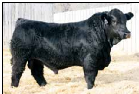
Lot 3 - IPU El Tigre 90B