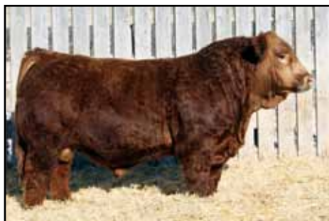
Lot 8 - IPU El Tigre 121B