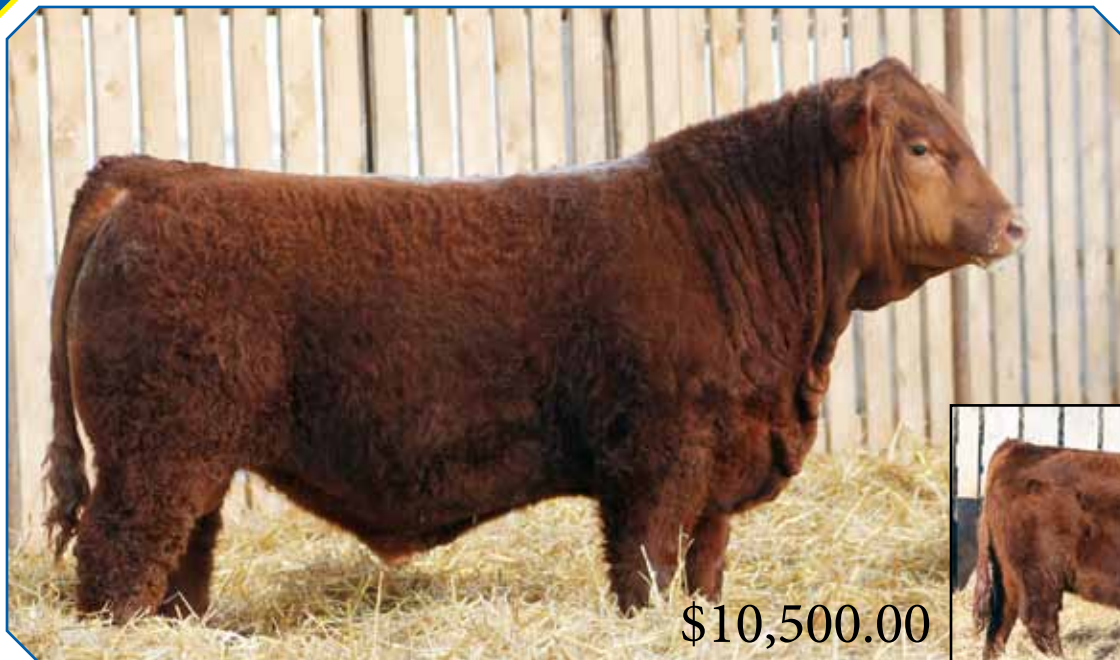
Dam - IPU 68M Pocahontas 177Y