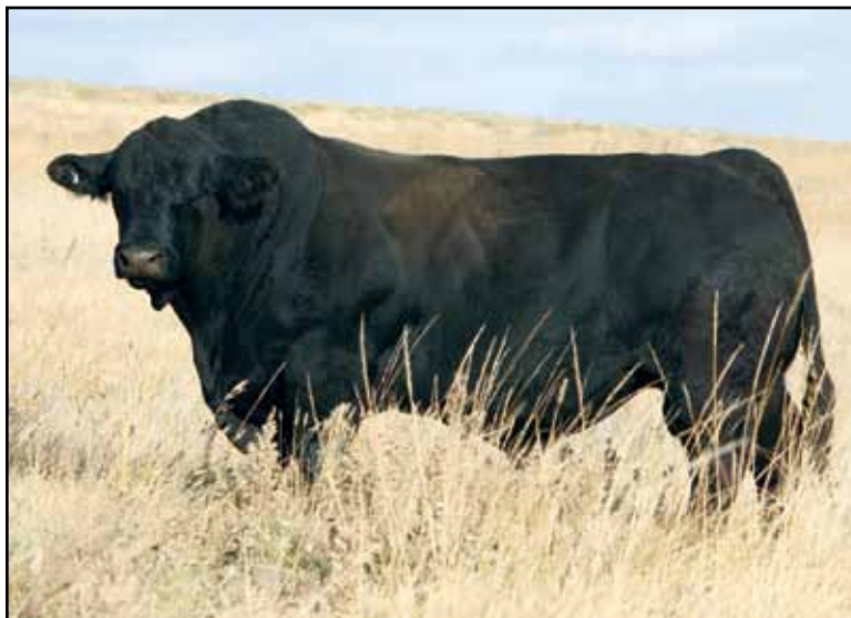
Springcreek Liner 56U