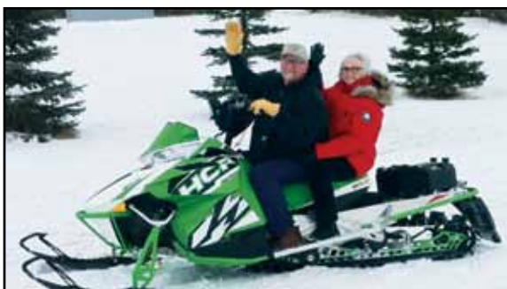
Grandma and grandpa sledding on Christmas Day