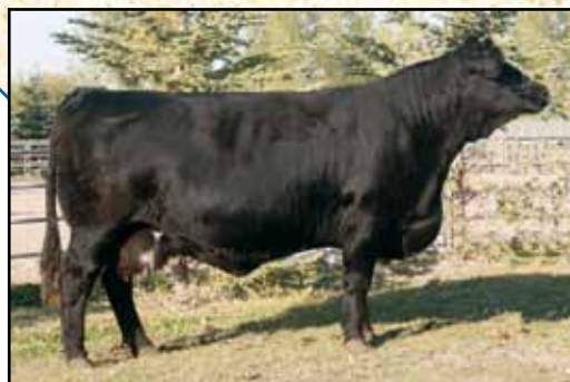
Dam - Ultra Temptress Clair 12R