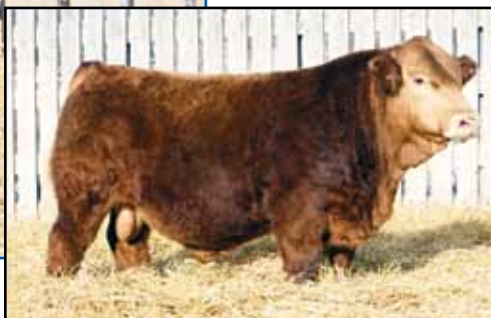
Maternal brother - IPU 65A

POLLED PUREBRED MALE PTG1128669 IPU 121B 15 February 2014